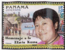
Kuna Indians AP116

Designs: No. C461, 50c, Village, people in canoe, woman. No. C462, 50c, Man and woman, vert. No. C463, 60c, Woman sewing. No. C464, 60c, Dancers. 1.50b, Fish.