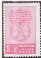
"The World Against Malaria" — SPAP1

Catalogue values for unused stamps in this section are for Never Hinged items.