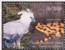
America Issue - Endangered Species — AP119

2003, Nov. 24 C468-C469 AP118 Set of 2 3.50 3.50