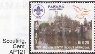
Scouting, Cent. AP121

2003, Dec. 3 C471 AP120 40c multi 1.25 1.25