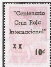
No. CB4 Surcharged in Black

CB7 AP81 10c on 5c+5c 6.00 5.00 Intl. Red. Cross cent.