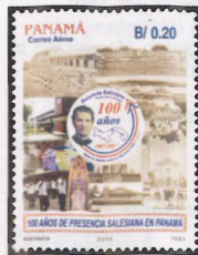
Salesian Order in Panama, Cent. — AP122

2010, Sept. 3 Litho. Perf. 14 C472 AP121 20c multi .40 .40 Printed in sheets of 4.