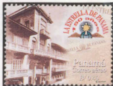
La Estrella de Panama Newspaper, 150th Anniv. — AP120

2003, Nov. 26 C470 AP119 2b multi 6.25 6.25