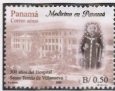
Medicine in Panama AP117

C465 AP116 1.50b multi 5.75 5.75 Dated 2002. No. C465 contains one 50x45mm stamp.