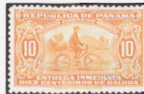
Bicycle Messenger SD1

1926 Unwmk. Perf. 12 E1 A31 10c org & blk 7.50 3.25 a. "EXPRESO" 40.00 E2 A32 20c brn & blk 10.00 3.25 a. "EXPRESO" 40.00 b. Double overprint 35.00 35.00